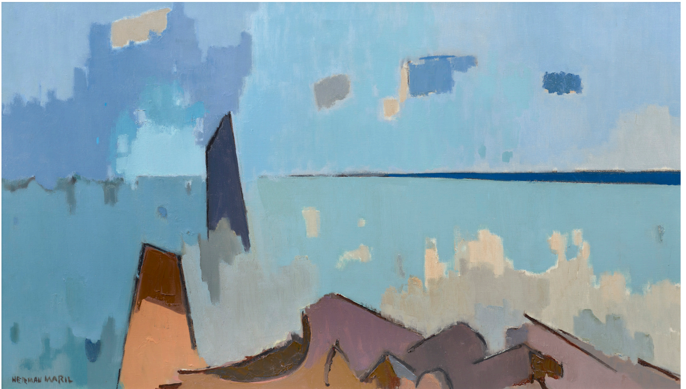
Intide , 1958, oil on canvas, 23½ x 40 in.