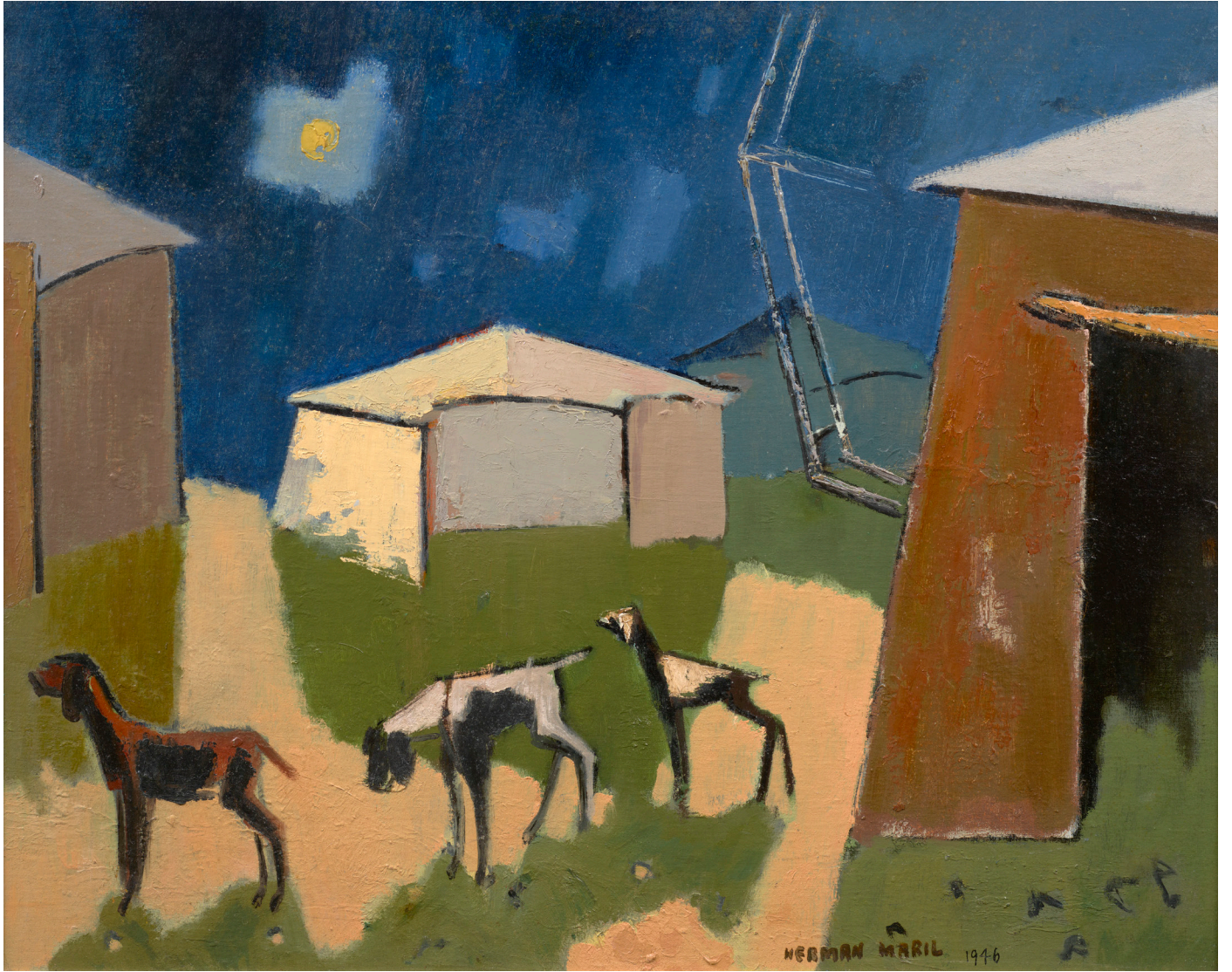
At the Fair Grounds , 1946, oil on canvas board, 24 x 30 in.