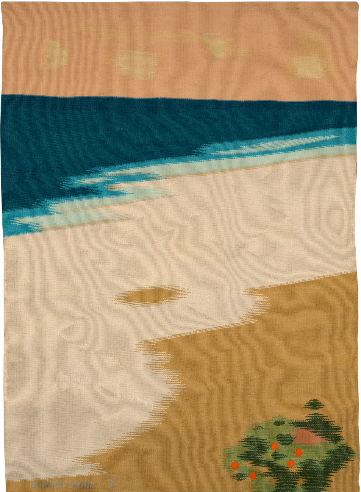
The Sea , circa 1972, tapestry, 47 x 35 in.