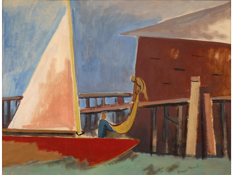
Coming In , 1960, casein, watercolor, and pencil on paper, 19½ x 24½ in.