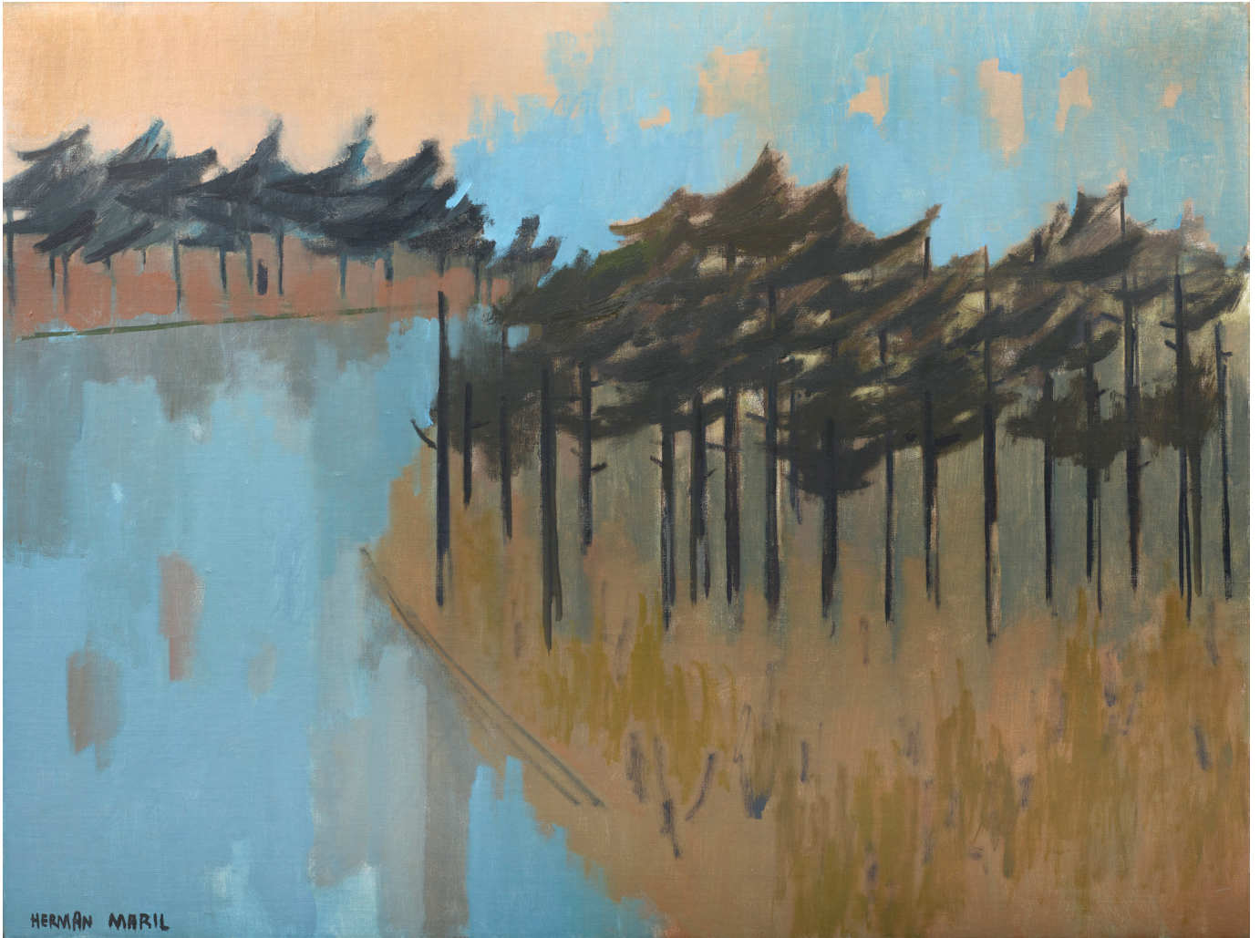
Dark Pines , 1967, oil on canvas, 36 x 47¾ in.