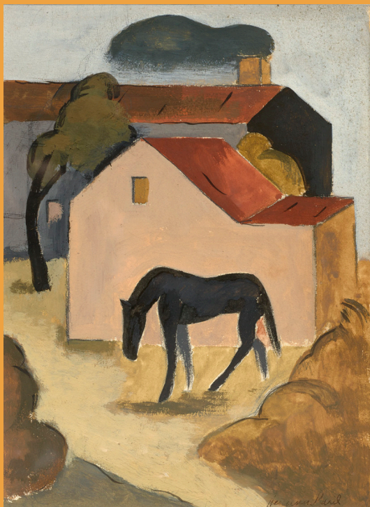
Horse , circa 1930s, gouache on paper, 12 x 8 in.

COVER: Trees and Road , 1980, oil on canvas, 40 x 36 in.