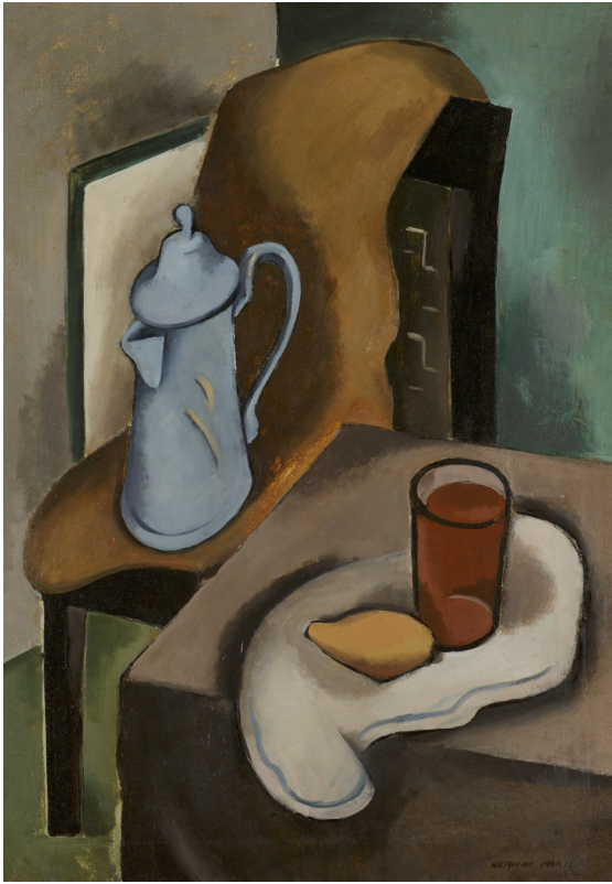
Interior with Pitcher , 1931, oil on canvas, 25 x 18 in.