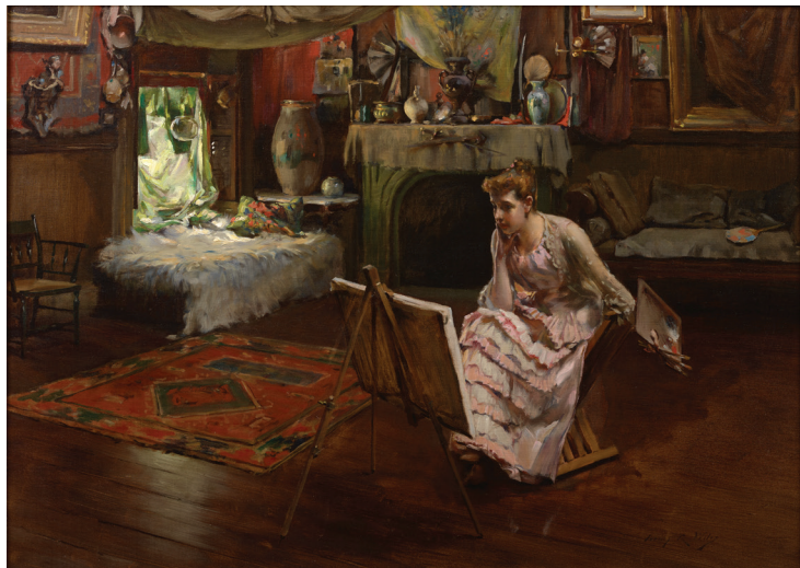
IRVING RAMSEY WILES (1861–1948) Discouraged , circa 1889, oil on canvas, 26 × 36 in.