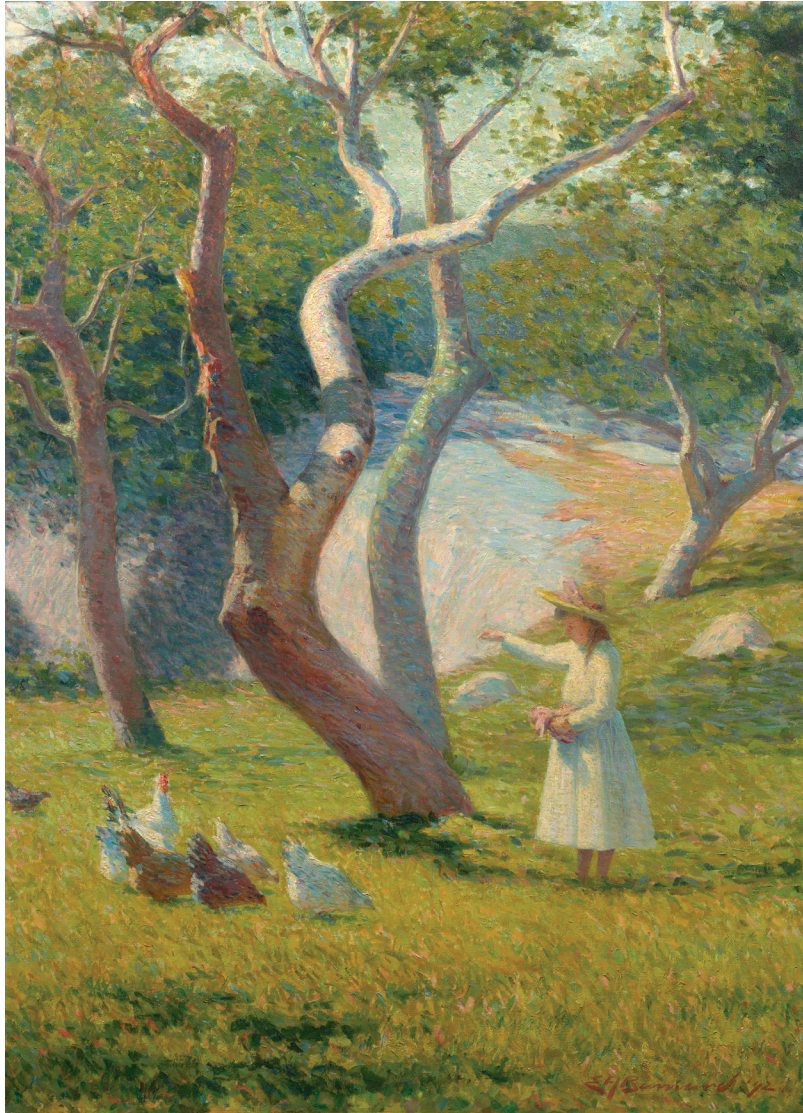
EDWARD HERBERT BARNARD (1855–1909) Mid-Day , 1892, oil on canvas, 53\frac{1}{4} \times 39\frac{3}{8} in.