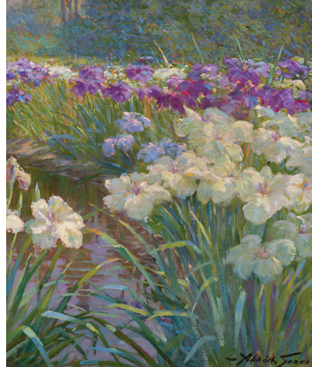
ABBOTT FULLER GRAVES (1859–1936) On the Banks of the Oise , 1887–1890 oil on canvas, 30 × 25 in.