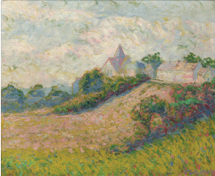
THEODORE EARL BUTLER (1861–1936) Church, Giverny , 1896, oil on canvas, 23½ × 29 in.