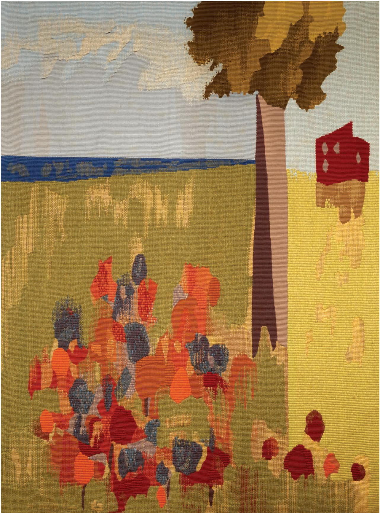
The Garden , 1972, tapestry, 80 x 60 in.