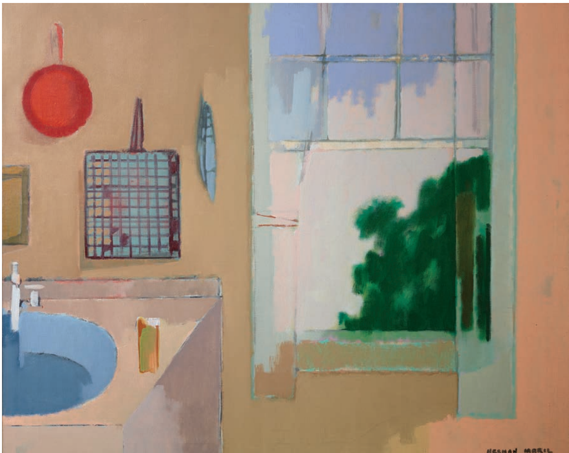
The Window , 1971, oil on canvas, 40 x 50 in.