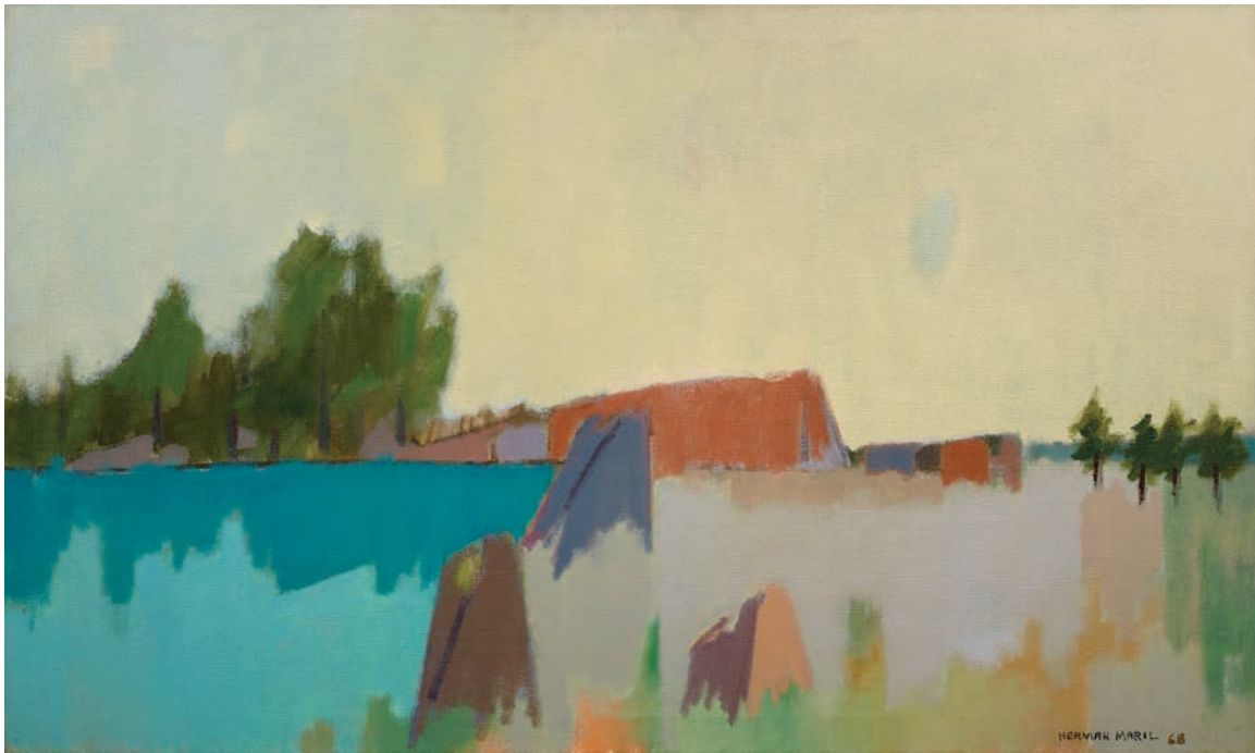
Horizontal Passage , 1968, oil on canvas, 30 x 50 ½ in.