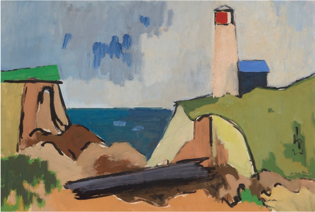
Highland Light , 1952, casein on board, 14 \frac{7}{8} x 22 \frac{1}{16} in.