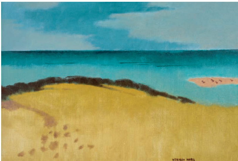
Gulls on the Bar , 1985, oil on canvas, 24 x 36 in.