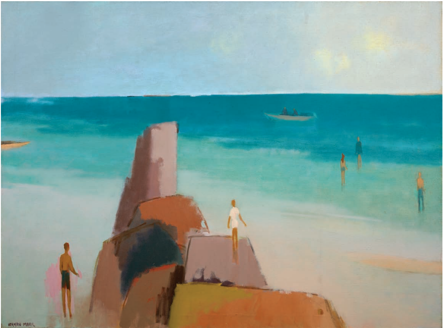
Kendall Lane Beach , 1983, oil on canvas, 35 ¾ x 47 ½ in.