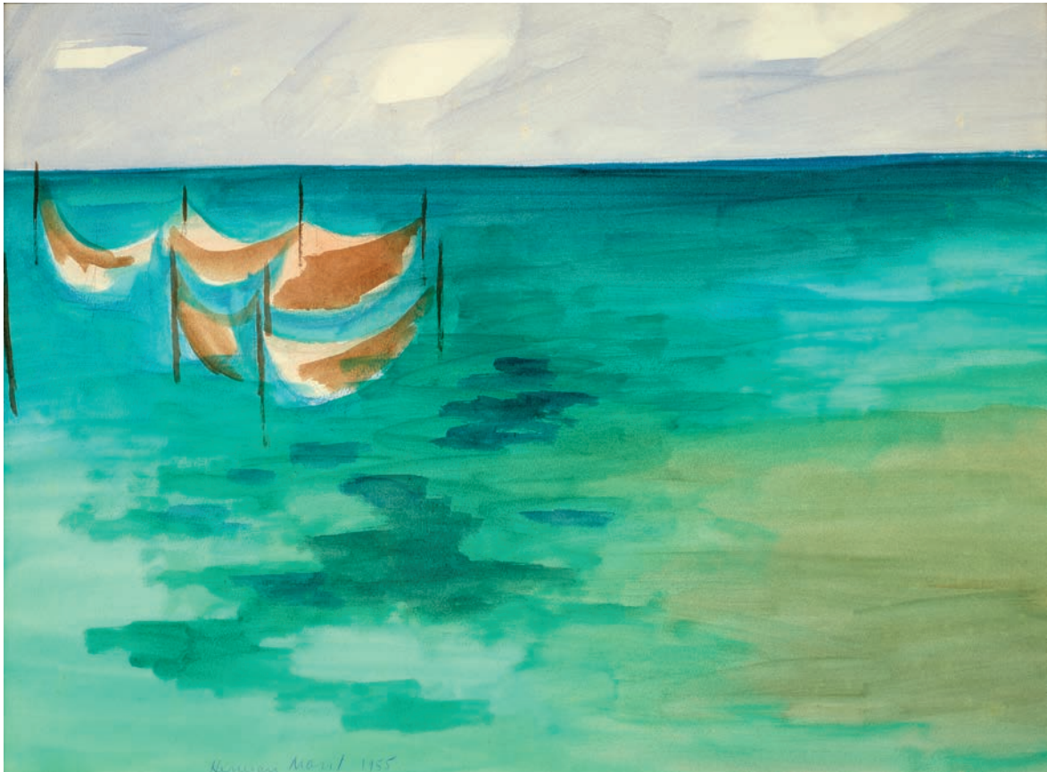
The Weirs , 1955, casein, watercolor, and pencil on paper, 18 \frac{7}{8} x 24 \frac{1}{4} in.