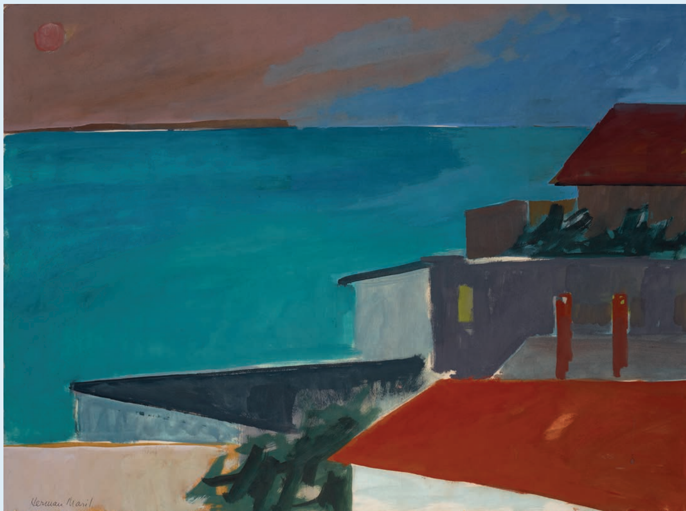
Evening Rooftops, Provincetown, 1969, casein on paper, 23 x 31 in.

COVER: High Dune, 1977, oil on canvas, 60 x 39½ in. (detail)