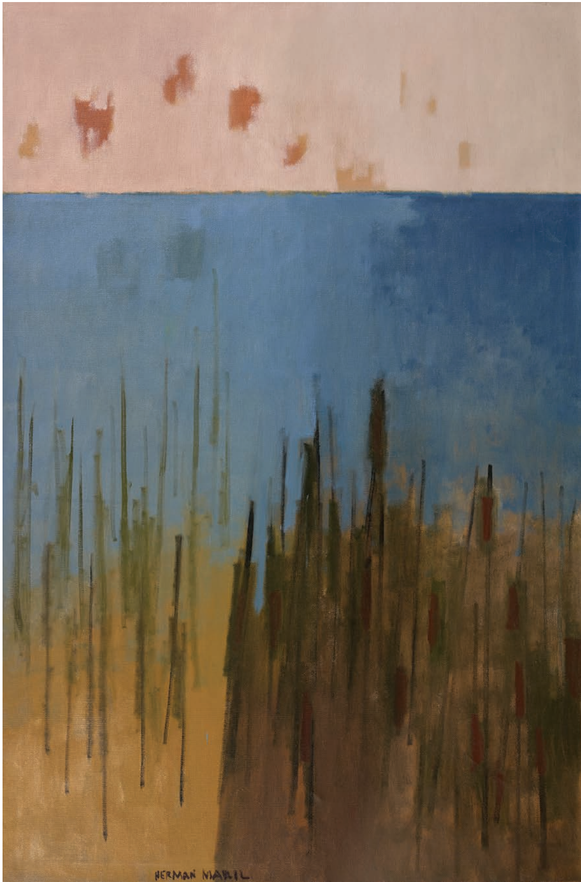
Cat Tails , 1967, oil on canvas, 60 x 40 in.