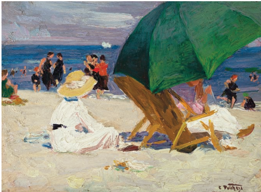
EDWARD HENRY POTTHAST (1857–1927) The Green Umbrella , circa 1910–15 signed E. Potthast , lower right, oil on panel, 8¾ × 12 in.