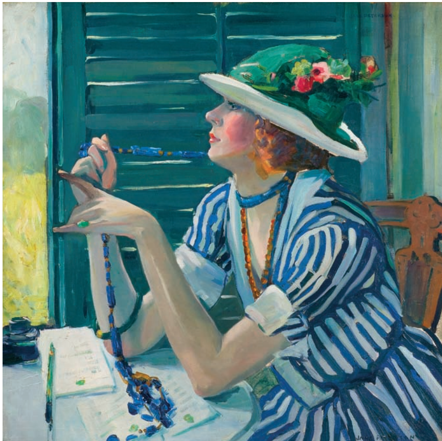
JANE PETERSON (1876–1965) The Answer , circa 1929 signed Jane Peterson , upper and lower right, oil on canvas, 32¼ × 32⅛ in.