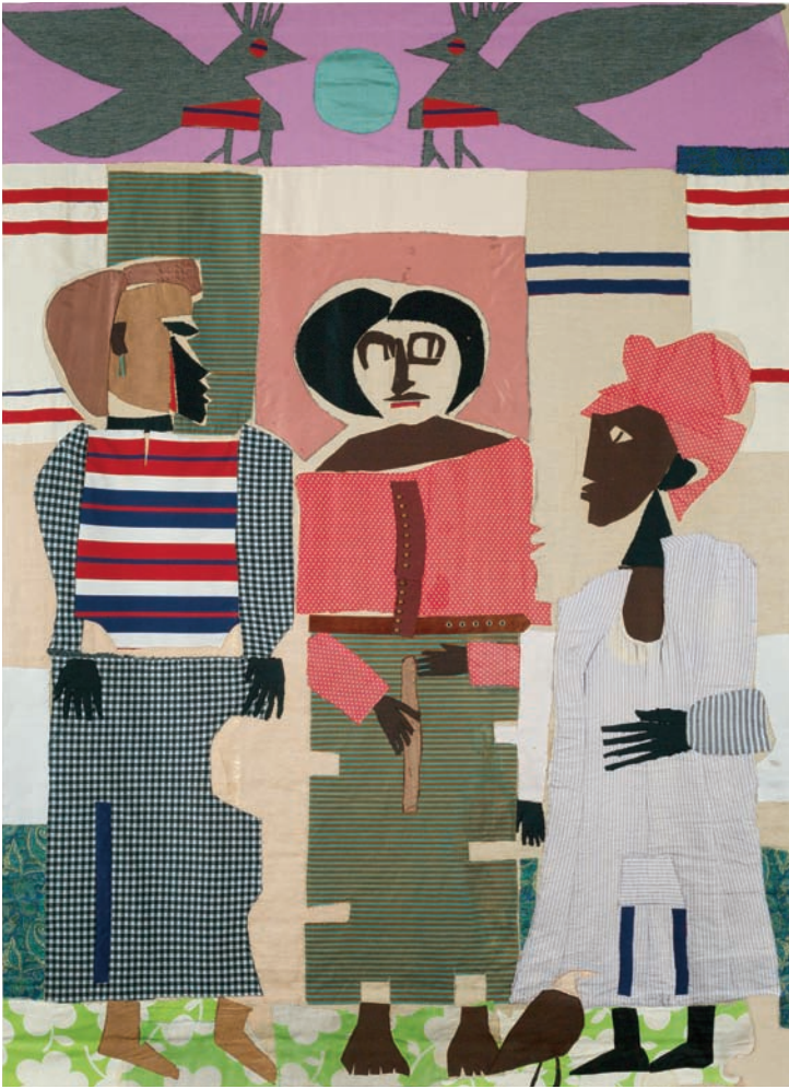
ROMARE BEARDEN (1911–1988) Junction Piquette , 1971 fabric collage on canvas, 92 × 68 in.