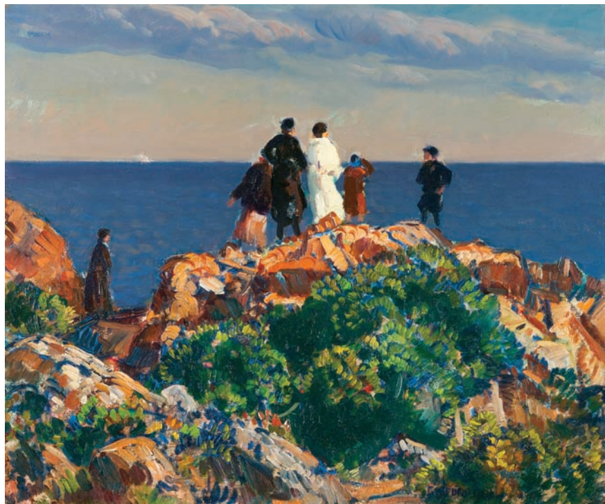
GIFFORD BEAL (1879–1956) Bass Rocks, Gloucester , circa 1923–30 signed Gifford Beal , lower right, oil on board, 20 × 24 in.