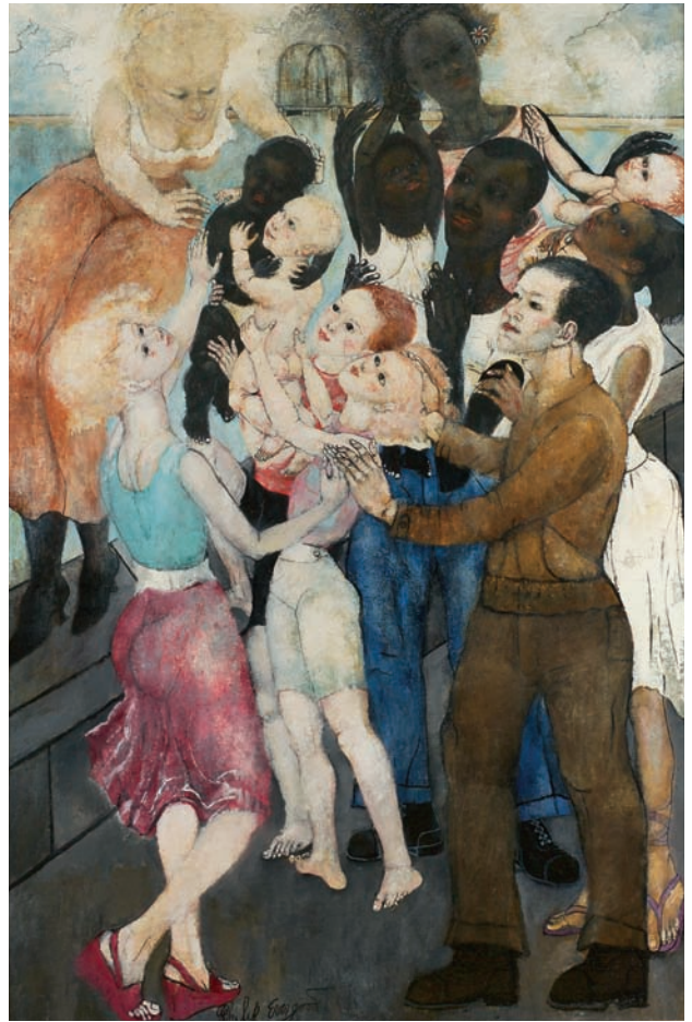
PHILIP EVERGOOD (1901–1973) The Future Belongs to Them , 1938–53 signed Philip Evergood , lower center, oil on canvas, 60 × 40 in.