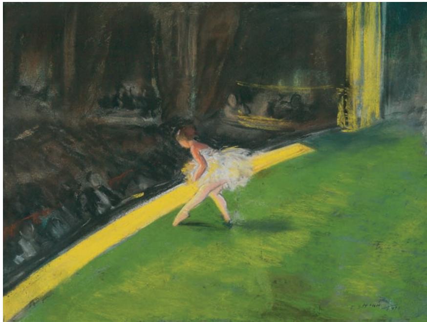
EVERETT SHINN (1876–1953) The Yellow Dancer signed E. Shinn and dated 1911 , lower right, pastel on board, 14 3 / 8 × 19 1 / 2 in.