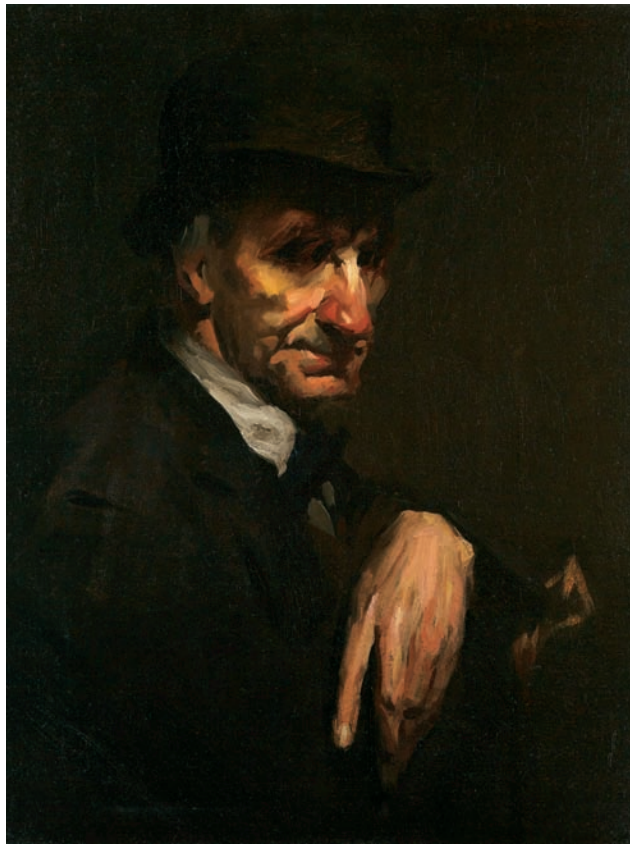
GEORGE WESLEY BELLOWS (1882–1925) The Black Derby , 1905 signed Geo Bellows , upper right, oil on canvas, 26 × 20 in.