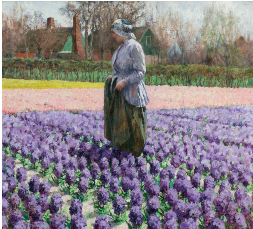
GEORGE HITCHCOCK (1850–1913) A Field of Hyacinths, Holland , circa 1890s signed Hitchcock , lower right, oil on canvas, 28½ × 32¼ in.